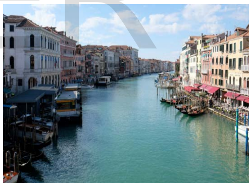
Fig.2. The Grand Canal in Venice, Italy

The Ganga water in Haridwar has become pure and transparent and fit to drink directly as a result of the nationwide lockdown period to curb covid19 said by Professor BD Joshi, the Uttar Pradesh Pollution Control Board (UPPCB). Such a remarkable success could not be obtained by number of the government schemes worth of thousands of crores. 9