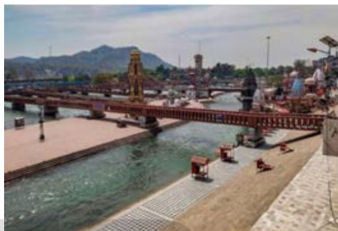
Fig.1. Ganga Water, at Haridwar, India